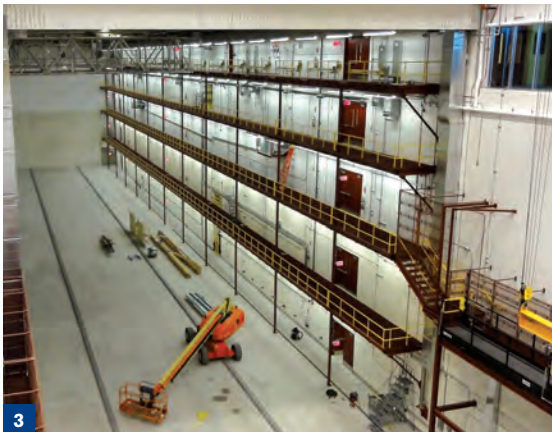
1. The experiment involves about 180 scientists and engineers from 28 institutions. 2. Rock removed to dig a 40-foot-hole to house the detector and building was repurposed for the site's berm and road. 3. Interior of the detector hall. The detector will be installed in 2012. 4. The building housing the NOvA far detector, which weighs as much as 150 fully loaded school buses.