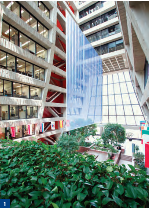
1. An illustration of how large one 51.2-foot-by-51.2-foot plane of the far detector would be if it were hanging in Fermilab's 16-story Wilson Hall. 2. Reflective plastic tubes filled with mineral oil will help record bursts of light given off by neutrinos striking an atom in the liquid.

Little by little the neighbors are becoming neutrino savvy. Every time the NOA collaboration