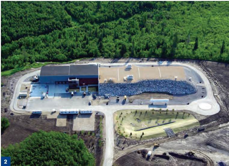
1. Completed NOvA experiment building in Minnesota. 2. The roof uses a six-inch layer of barite, which is 60 percent heavier than a six-inch layer of common granite, to shield the detector inside from cosmic rays. NOvA is a two-detector experiment with the smaller of the two, a 200-ton “near detector,” at Fermilab, and a 15,000-ton “far detector” 503 miles away in Ash River, Minn.