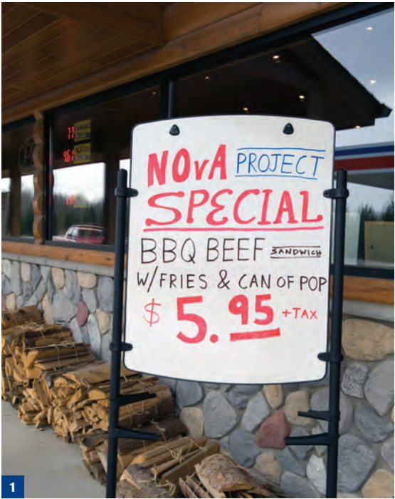
1. Neighbors in Ash River and the surrounding Minnesota towns welcome the NOvA construction project and the extra business it brings to their stores, restaurants, and accommodations.